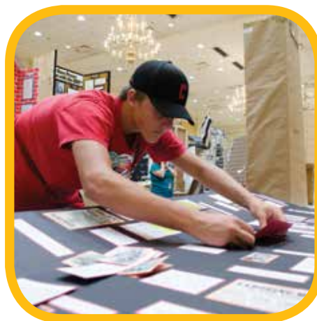
FIGURE 4 | EXHIBIT SIZE LIMIT ILLUSTRATION