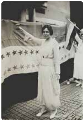
Alice Paul, 1918

Alice Paul was responsible for the campaign for women’s suffrage and the introduction of the Equal Rights Amendment.